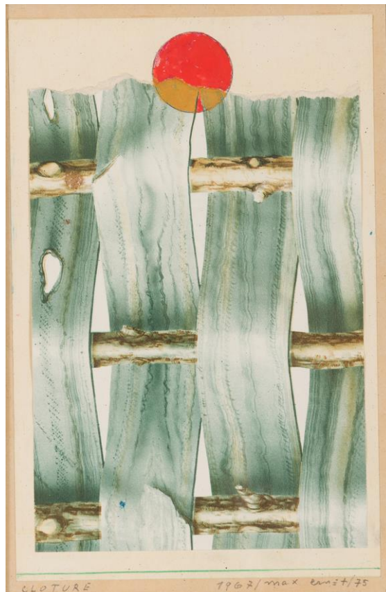
MAX ERNST, CLOTURE , 1967/1975, COLLAGE AND GOUACHE ON PAPER, MOUNTED ON PAPERBOARD, 10 1/4" X 6 3/4"