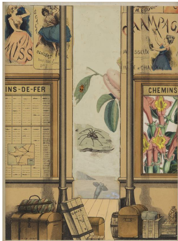
MAX ERNST, LES FILLES, LA MORT, LE DIABLE , 1970, GOUACHE, WATERCOLOR, PENCIL, AND PAPER COLLAGE ON PAPER, 12 1/2" X 9 1/4"