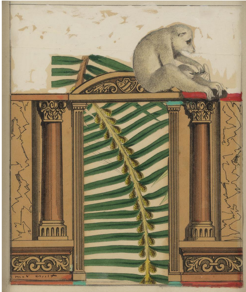
MAX ERNST, Singe , 1970 GOUACHE, INK, AND COLLAGE ON PAPER, 7 ¼" X 6".