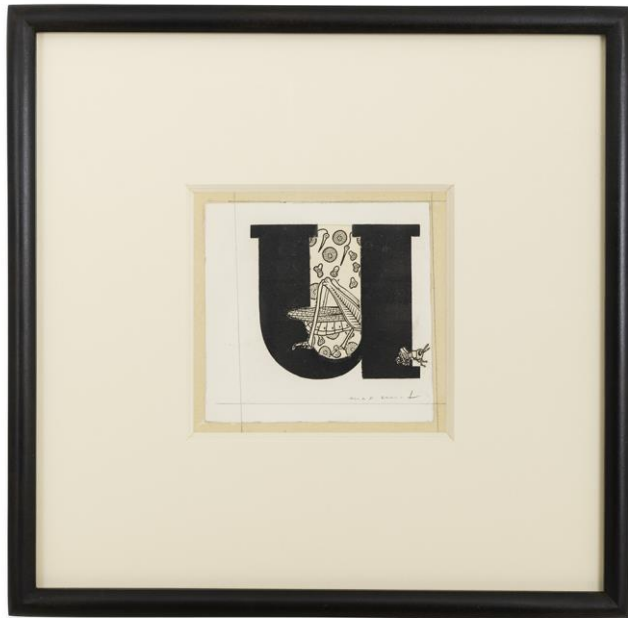
MAX ERNST, LETTRINE U , 1958, PEN, INK, AND COLLAGE ON PAPER, 9½" X 9 ½" X 1 ¼", FRAMED.