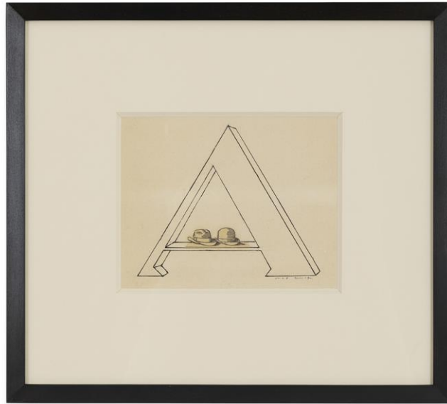
MAX ERNST, LETTRINE A , 1958, PEN, INK, AND COLLAGE ON PAPER, 10" X 11 1/8" X 1 1/4", FRAMED.