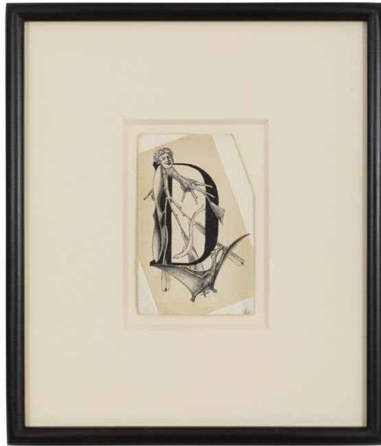
MAX ERNST, LETTRINE D , 1948, INK AND COLLAGE ON PAPER, 10 3/8" X 8 7/8" X 1 1/4", FRAMED.