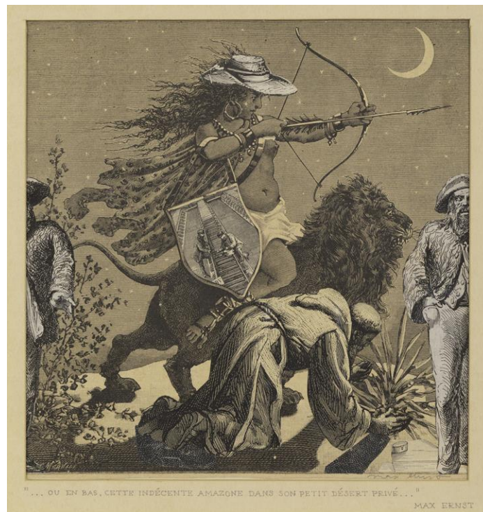
MAX ERNST, ... OU EN BAS, CETTE INDÉCENTE AMAZONE DANS SON PETIT DÉSERT PRIVÉ... , 1929/30, COLLAGE ON PAPER, 8 7/8" X 8 ½".PRIVATE COLLECTION.