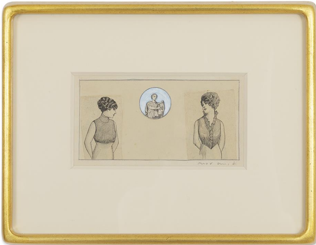
MAX ERNST, DEUX JEUNES DAMES , 1972, GOUACHE, PENCIL, INK, AND COLLAGE ON PAPERBOARD, 9" X 11 3 / 4 " X 1 1 / 2 ", FRAMED.

A new exhibition of Ernst's collages (on view at Paul Kasmin's 297 Tenth Avenue location through February 29, 2020 ) presents approximately forty of them, some of which are being displayed for the first time. A selection of images from the show appears below.